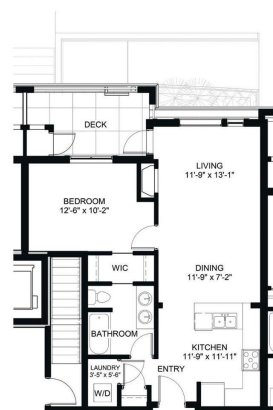
FLOOR PLAN F (1 st FLOOR)