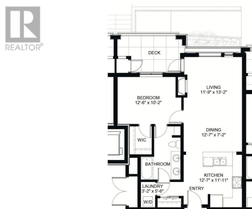
FLOOR PLAN D (2 nd /3 rd Floor)