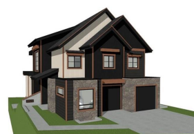
FRONT 3D PERSPECTIVE VIEW